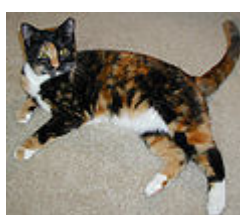
Black tortie & white HP = DSH f 09