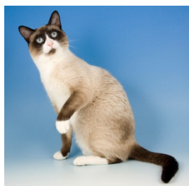
Snowshoe = SNO n 05