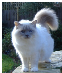
Lilac Pt. Birman = SBI c