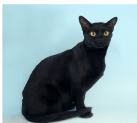
GCCF Bombay = ASS n