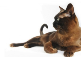
Brown Burmese = BUR n