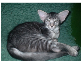
Silver Shaded Oriental LH = OLH ns 11