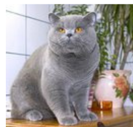
British Blue = BRI a