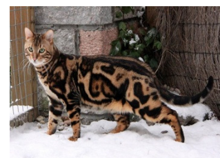
Brown Marble Bengal = BEN n 22